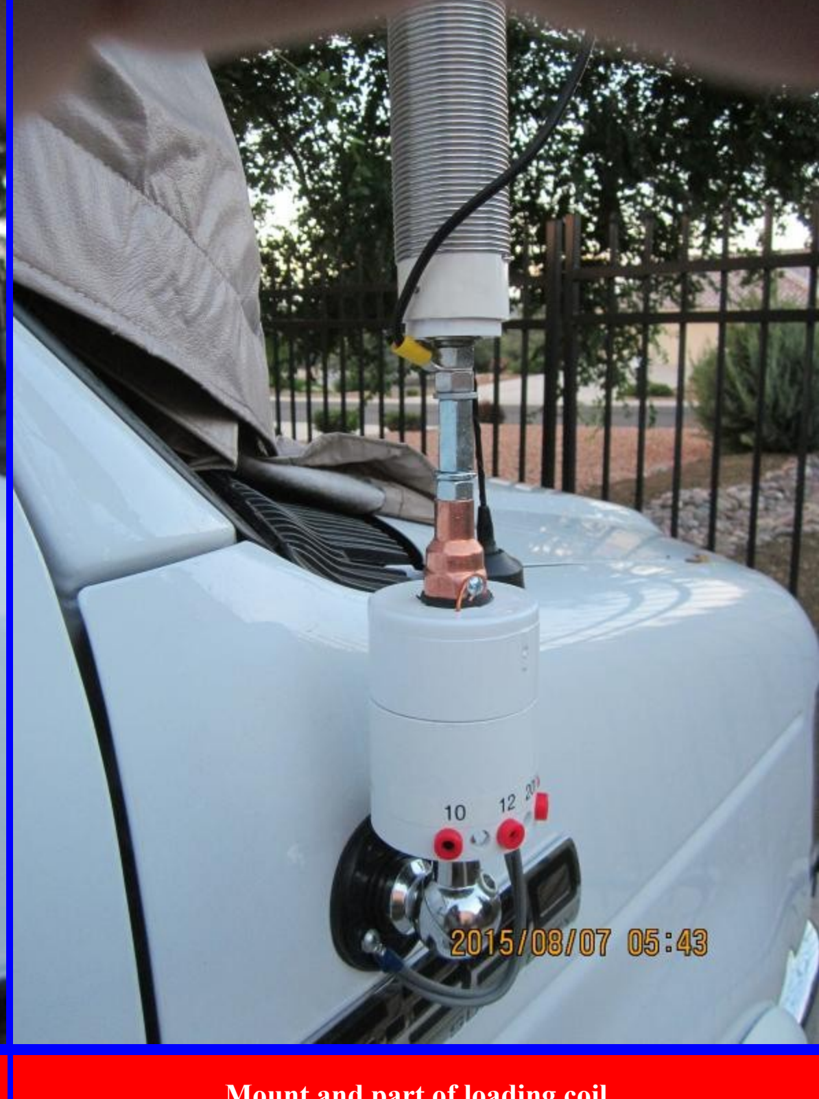
Mount and part of loading coil