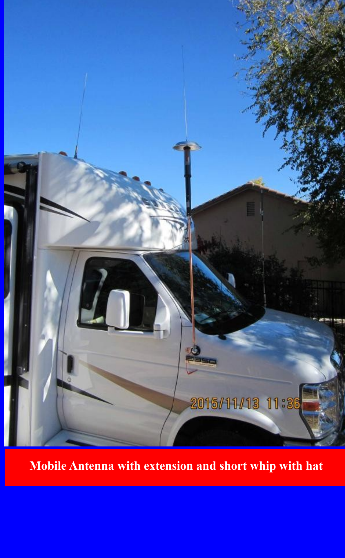
Mobile Antenna with extension and short whip with hat