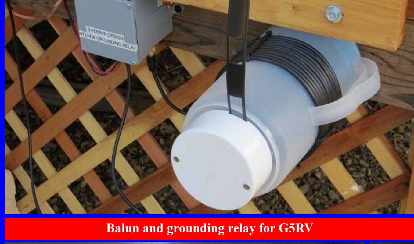
Balun and grounding relay for G5RV