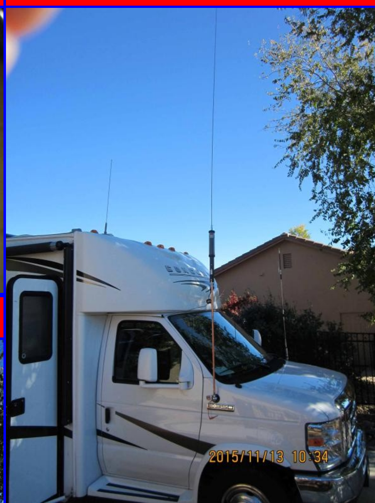
Antenna with long whip and copper mast extension