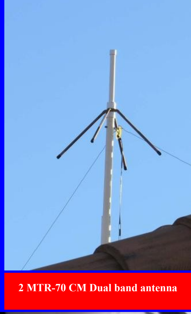
2 MTR-70 CM Dual band antenna