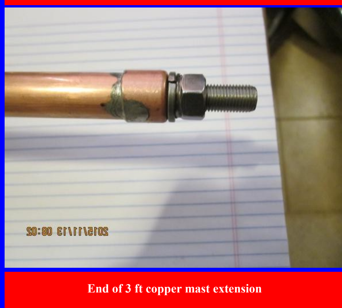
End of 3 ft copper mast extension