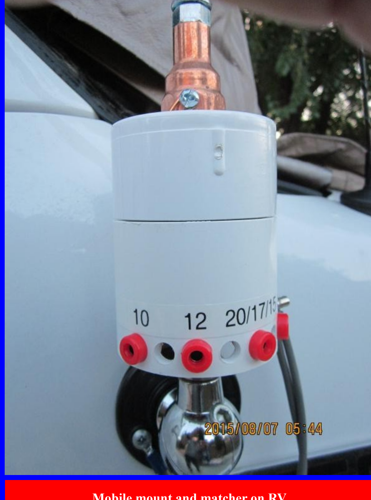
Mobile mount and matcher on RV