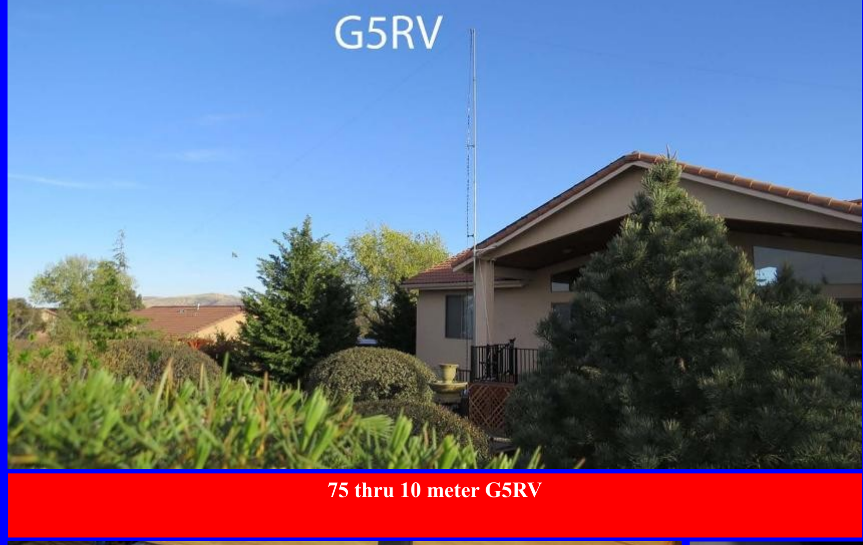
75 thru 10 meter G5RV

These are various projects from various construction projects at the AA7ZL bench