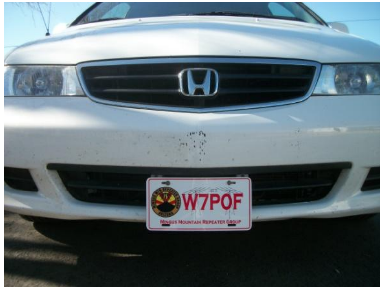
MMRG License plates